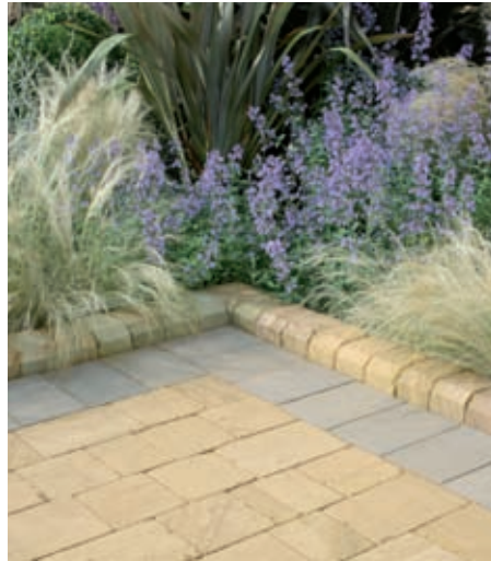
Beech and Willow with Beech Kerb new